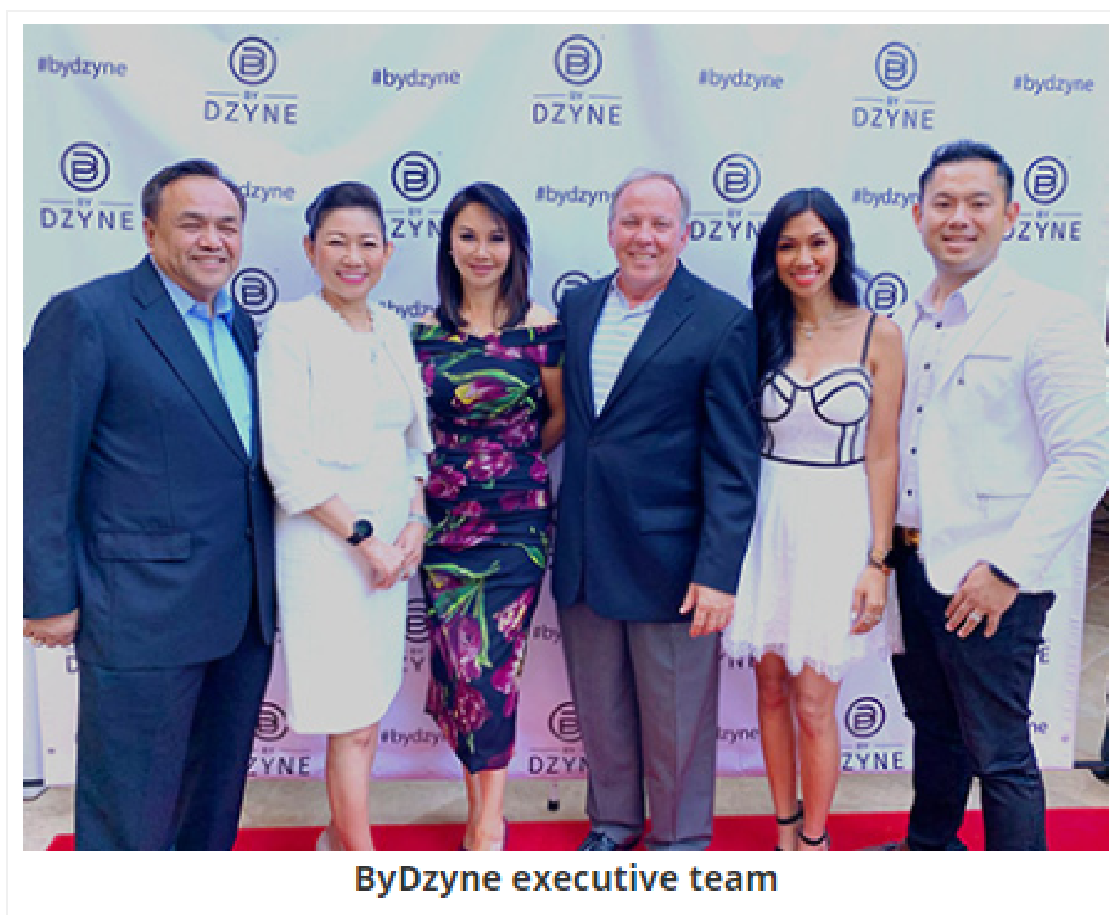
ByDzyne executive team

Our heart has always been to maintain integrity, honesty, and authenticity in business, and to continually create value for our customers and promoters. However, at times conditions can develop within a company that challenge this core business philosophy. Those are some of the most difficult circumstances we have faced in this profession, and they have unfortunately resulted in us having to make the tough decision to part ways.